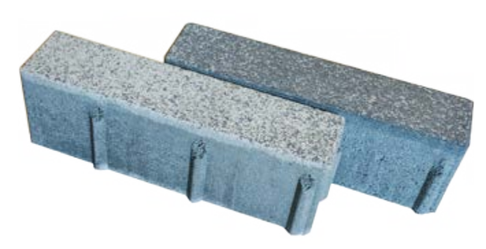
PRIVATE DRIVE PERMEABLE PAVER