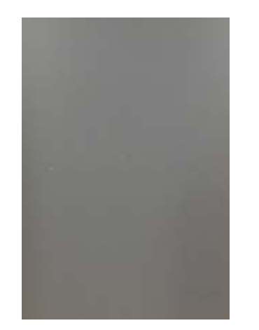
METAL PANEL COLOR