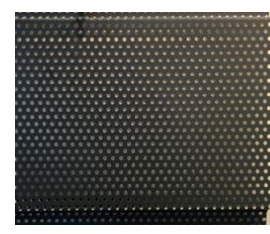
METAL SCREEN WALL